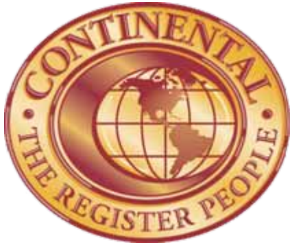
Continental Register Company